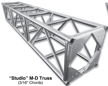
"Studio" M-D Truss (3/16" Chords)