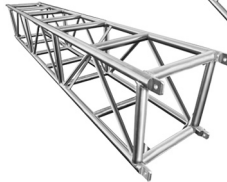
Studio M-D Truss